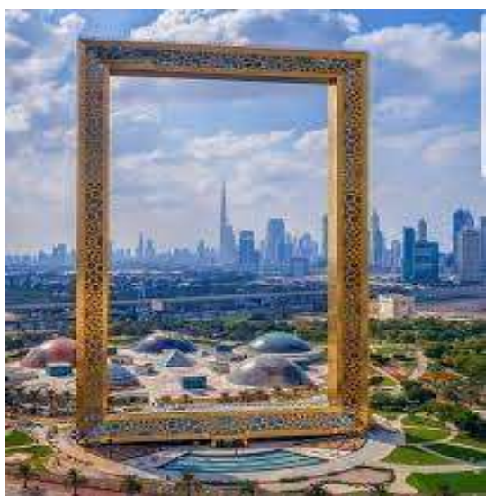
<u>Day 6 - Dubai Frame , Museum of Future , Shopping and Fly back with pleasant memories</u>

fastest rollercoaster. Get all-day access to hyper-fun rides now . Return back to Dubai hotel for Overnight.