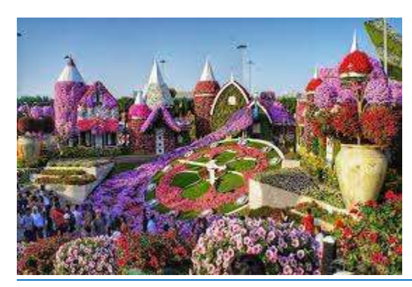
<u>Day 4 - Miracle garden and Global Village</u>

Take some rest before setting out for the Dhow Cruise in the evening. Watch the enchanting views of the city as you sail by on the Dubai Creek and kickstart your stupendous Dubai vacation. Enjoy a lavish spread of an international buffet dinner and get pampered by the cruise's unbeatable hospitality. Let the cool breeze flowing in on the open air deck tickle your senses while you dine. Return to your hotel and end the first day of your Dubai tour with a sound sleep.