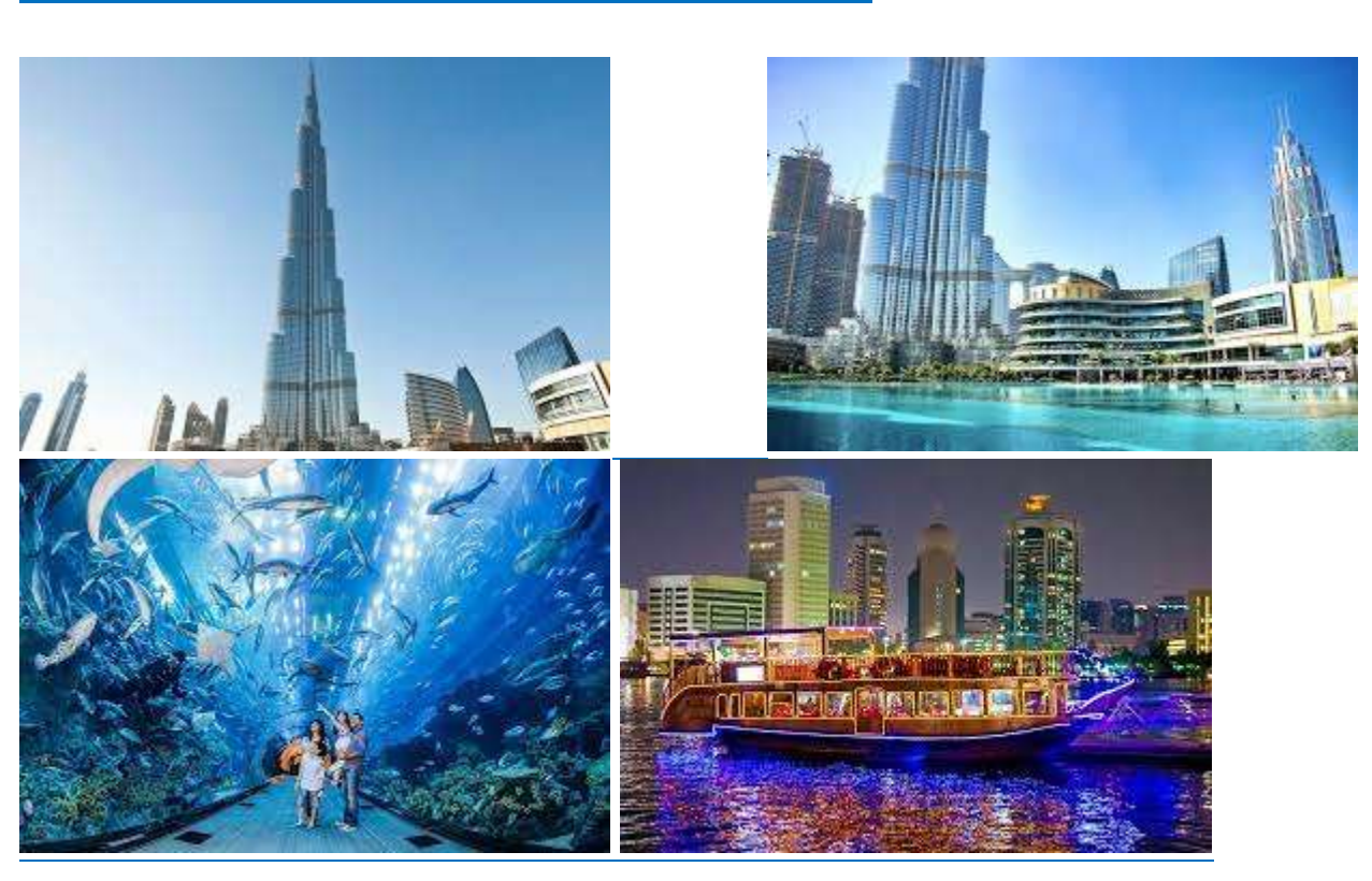
Day 3 - Bhurj Khalifa, Dubai Mall Dhow Cruise

Later in Evening proceed for Desert Safari, Dubai trip can never be completed without a Desert Safari. Dubai desert safari surrounding in the sandy desert is an exciting and electrifying experience. The Evening Desert Safari grants a thrilling ride over the sand dune, camel ride, and sand boarding. Before stopping at the desert camp to enjoy an Arabian Feast, the Barbecue dinner buffet is served during the Belly dance, Tanoura Dance and Haridi show. Return back to the hotel for overnight.